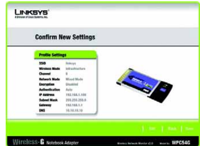
Figure 6-30: Confirm New Settings